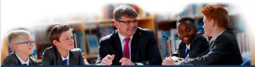
Bournemouth School • East Way • Bournemouth • BH8 9PY